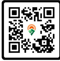
R1 Avenza Maps

Please visit the USFS Data, Information, and Geospatial SharePoint to view the most recent maps. This site is available only to USFS employees.