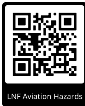
LNF Aviation Hazards