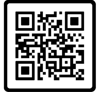
MDC Dispatch Locations