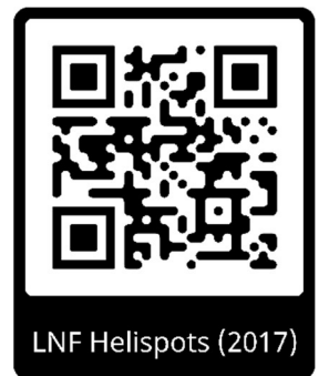
LNF Helispots (2017)