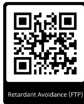
Retardant Avoidance (FTP)