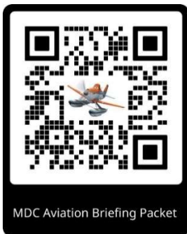
MDC Aviation Briefing Packet